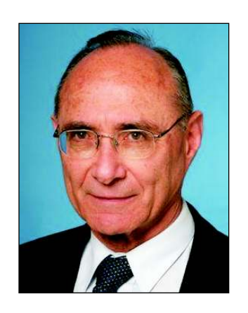
Uzi Landau Minister of National Infrastructures

A veteran leader of Israeli politics and a previously high ranking member of the Likud party, now with the "Israel beytenu" party, Dr. Uzi Landau held central positions as a member of the Israeli Knesset and government from 1984. Amongst his many political roles he served as the Minister of Public (Homeland) Security, a member of the Security Cabinet during the peak of the war on terror, a minister in the Prime Minister's Office responsible for overseeing Israeli intelligence and secret services and the US-Israel strategic dialogue, and as Chairman of the Foreign Relations and Defense Committee of the Knesset. Additionally, he served as chairman and member of a number of defence, economic, and government operations oversight committees of the Knesset. From 2006 through 2008 he was a Senior Research Fellow at The Institute for Counter-Terrorism (ICT) and the Interdisciplinary Center (IDC), Herzliya. Since April 2009, Dr. Landau has served as the Minister of National Infrastructures.